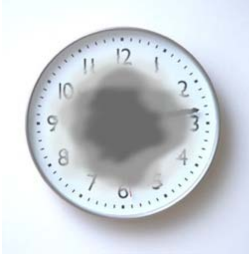
Central vision loss in macular degeneration