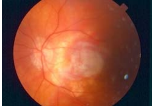
Wet Macular Degeneration